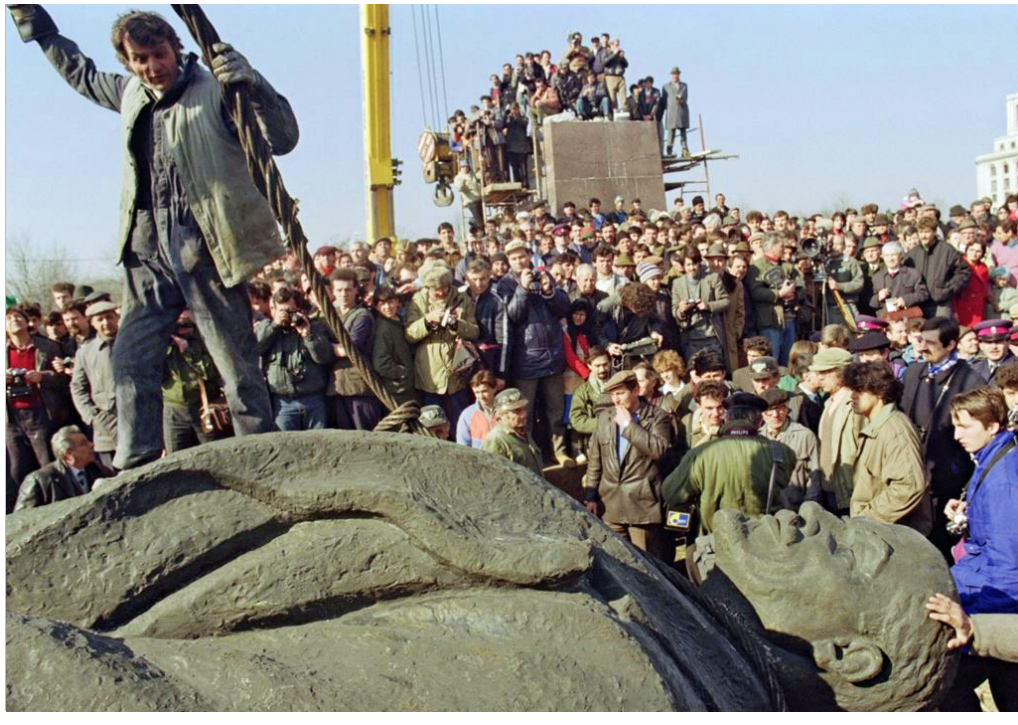
Brexit has been compared to the break-up of the Soviet Union, but will its impact be as far-reaching?

We can expect that much of the short-term impact will come from changes in investor,