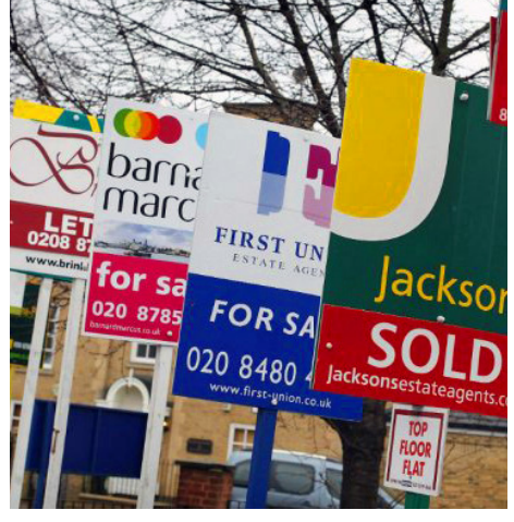
Government policy is focused on homeownership

This is unsurprising: releasing more supply would tend to reduce prices and hence developers' returns; plus housing market uncertainty is a disincentive to increasing sales risk. Private developers and housebuilders are accountable to shareholders who prioritise higher profits. The supply position is exacerbated by shortages of materials and labour, and the availability of skilled building