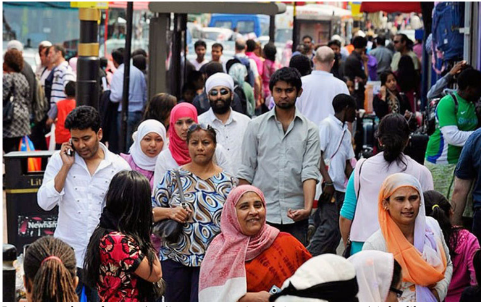
Barriers: members of some minority groups may struggle to access appropriate healthcare

recognise the community context - patients and carers should not be seen in isolation, but as parts of local networks of support;