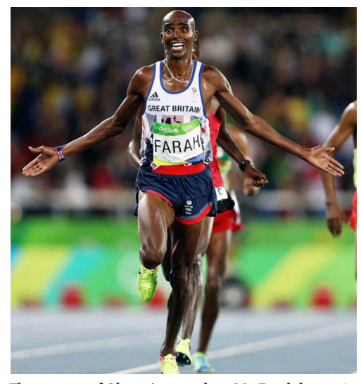
The success of Olympians such as Mo Farah has not translated into increased participation in sports

At the secondary level School Games Organisers (SGOs) are charged with supporting competition and the engagement of older children. Investment in school sport is set to